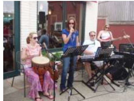
MVCC Worship Band

“We thank God for blessing the Martin Luther King Comm. Center...”